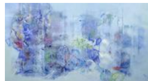
by Mary Kessel

We will use recycled materials to create sea creatures and features.